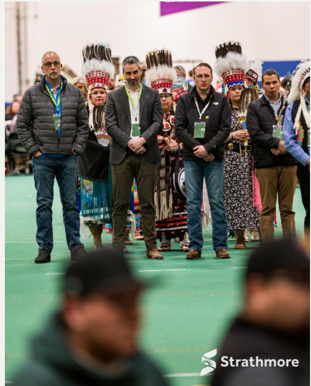
Our 2023 Title Sponsor: Epcor

People from across Canada and the US will be travelling to experience World Class First Nation singing and dancing, right here in Southern Alberta. With sponsorship, your organization will be shown as a huge ally to Indigenous culture, people, arts, and reconciliation. There is only one spot for this coveted honour and your recognition will be immense throughout this 3-day event.